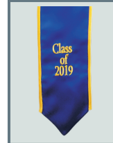
WITH GOLD TRIM

IF YOU SELECTED WITH TRIM: FROM THE ABOVE LIST OF COLORS, PLEASE ADD YOUR DESIRED TRIM COLOR HERE.